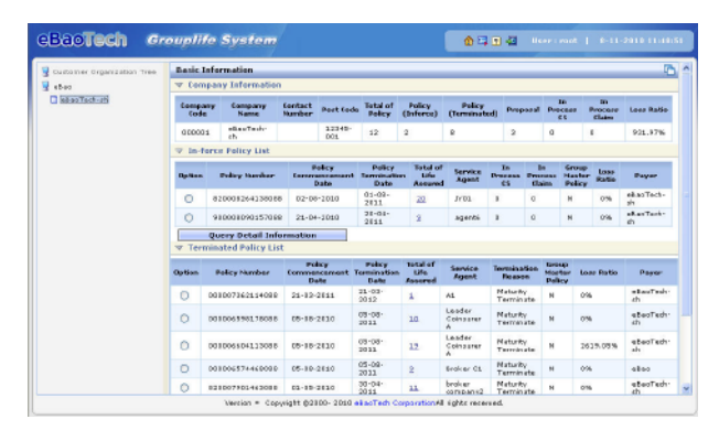
Figure 1: Sample Query on Policy Holder Organization Tree

Insured list upload functionality, shown in Figure 1, is supported in new business setup and in several customer services processes to simplify and automate the entry of insured individuals. Insured list or electronic document templates can also be configured by the business user via a user-friendly configuration tool.